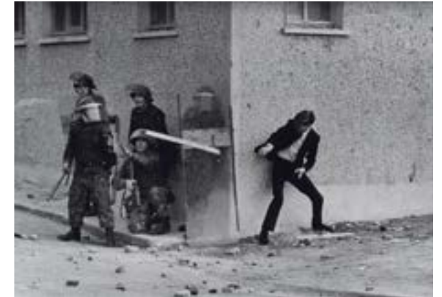
The Bogside, Londonderry, Northern Ireland 1971