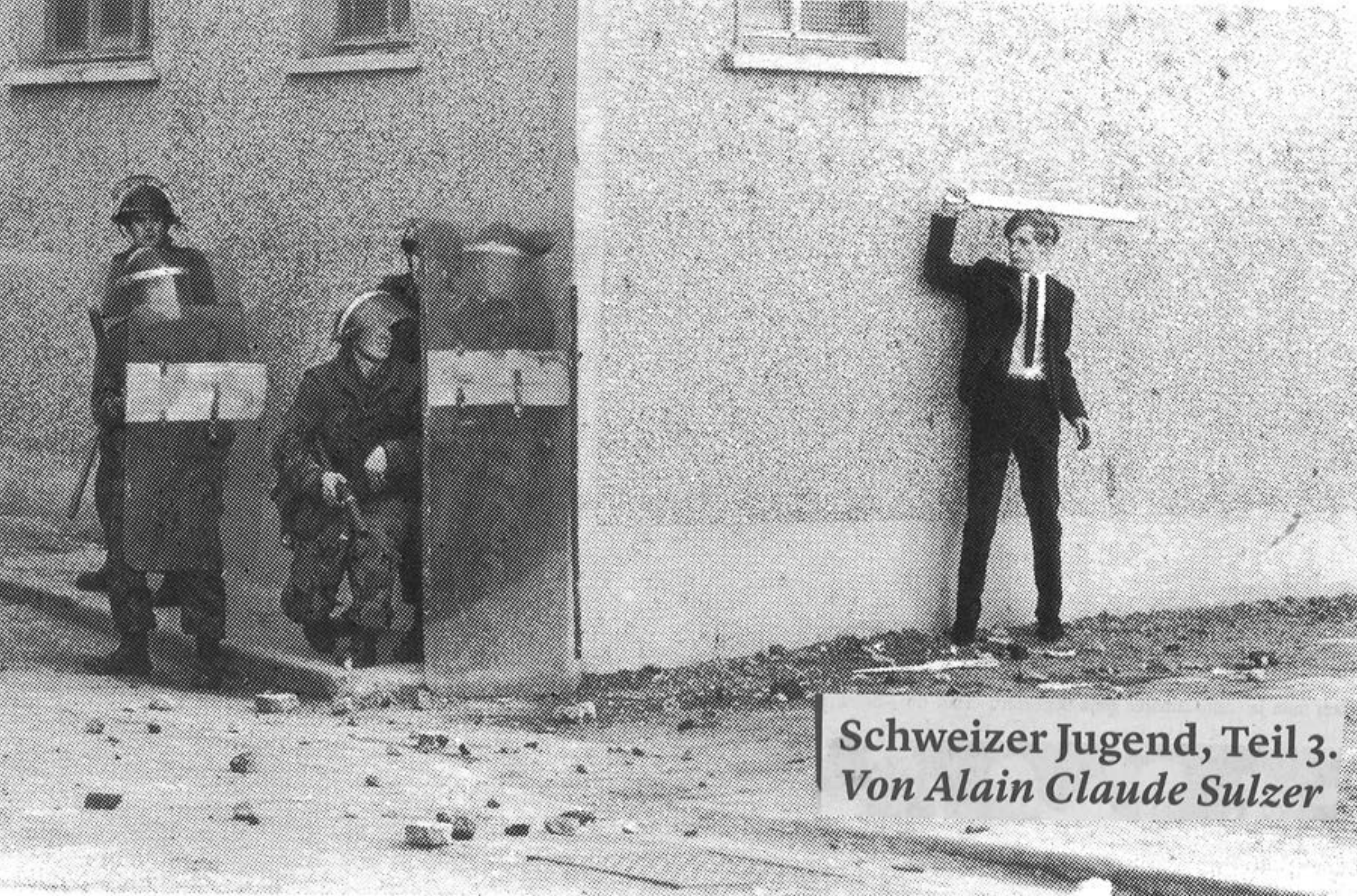
Schweizer Jugend, Teil 3. Von Alain Claude Sulzer